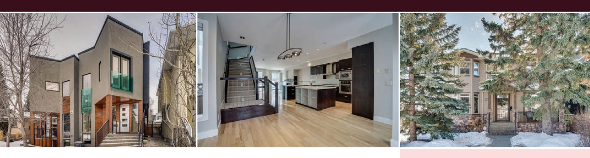
1718 37 Avenue SW 3 Bedrooms 3.5 Bathrooms Sold for 97% asking price

2003 41 Avenue SW 5 Bedrooms 4.5 Bathrooms Sold for 99% asking price